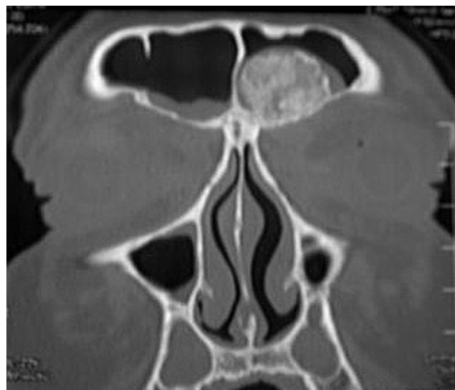
Fig. 1. CT scan (coronal view) of the 30-mm osteoma in the medial region of the frontal sinus.

The patient, a 44 year-old Caucasian man, has come to our observation because of an increasing headache affecting the left frontal orbital region. Three years before, the patient had undergone septoplasty for nasal obstruction, and a