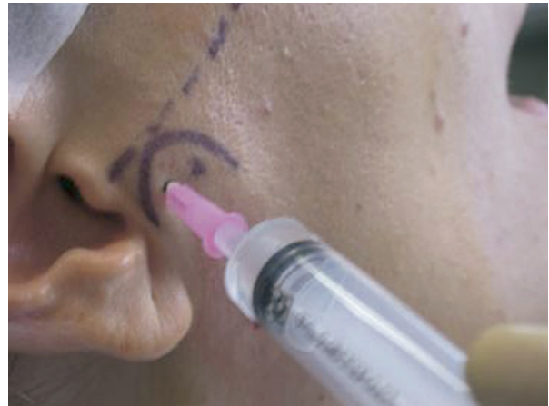
Fig. 3. Single-needle arthrocentesis.

displacement in the absence of fibrous adhesences, while it is more difficult to perform in the presence of intra-articular adhesences. Furthermore, even though tolerability is improved with respect to arthroscopy, the positioning of 2 needles within a small cavity like the TMJ may cause some discomfort to patients, particularly at the time of the first lavage. A study evaluating