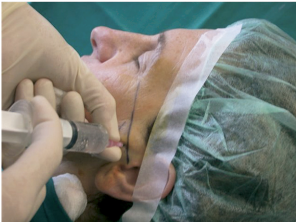
Fig. 5. Under pressure physiological saline injection.

lower amount of anesthetic should reduce the risks for an involvement of the facial nerve. Moreover, the insertion of a single needle should reduce the risks for nervous injuries as well, since an anteriorly positioned second needle may cause trauma to the facial nerve, which lays anteriorly and medially to the glenoid fossa, which is where the second needle is usually inserted.