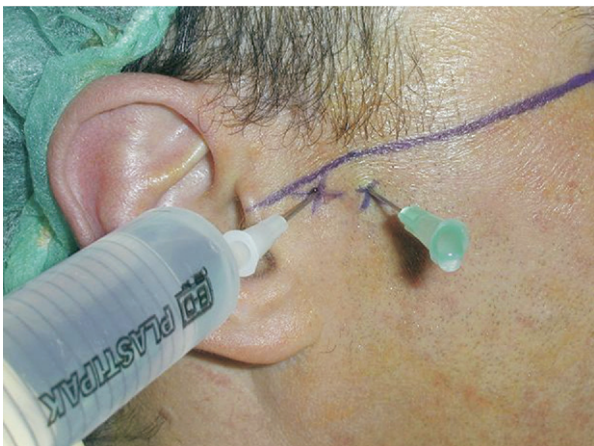
Fig. 2. Two-needle arthrocentesis.

displacement in the absence of fibrous adhesences, while it is more difficult to perform in the presence of intra-articular adhesences. Furthermore, even though tolerability is improved with respect to arthroscopy, the positioning of 2 needles within a small cavity like the TMJ may cause some discomfort to patients, particularly at the time of the first lavage. A study evaluating