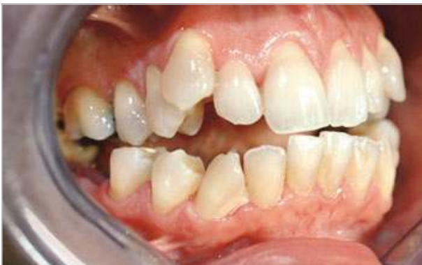
Fig 3 Open bite was shown in 7.4% of the study population. It was the only feature showing a slightly higher prevalence with respect to the available literature data at the general population level (3.3% to 7.1%).