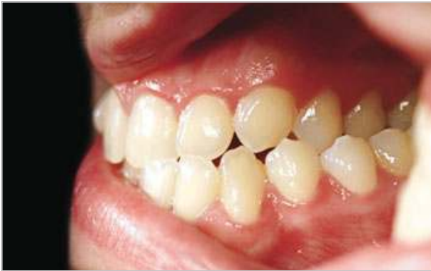
Fig 1 Posterior crossbite. The prevalence in our TMD patient population (25.0%) was similar to the prevalence described in studies on adult general population, ranging from 7.9% to 30.6%.