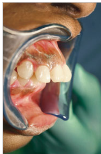
Fig 4 Excessive overjet ( \geq 5 mm), as shown in this lateral view, had a prevalence in the current TMD patient population (11.6%) that is within the range of the prevalence at the general population level (6.2% to 36.8%).

guidelines, standardized techniques for muscle and joint palpation are performed to assign axis I physical diagnoses of muscle disorders (ie, myofascial pain with or without limited opening), disk displacement (ie, disk displacement with or without reduction, with or without limited opening), and/or other joint disorders (ie, arthralgia, osteoarthritis, osteoarthritis). In this regard, it should be borne in mind that the updated version of such diagnostic criteria, now called DC/TMD, 26 was not available at the time of this investigation.