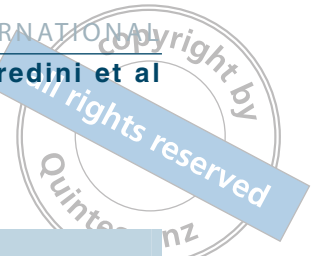
Table 1 Prevalence of the various malocclusion findings in the overall study group (n = 625), male (n = 153) and female subjects (n = 472)