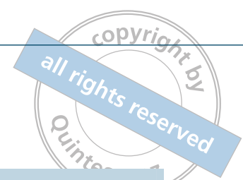
Table 3 Prevalence of the various malocclusion findings in the overall study group (n = 625) and comparison with available literature data on adult (> 18 years) general population. Note that no literature data are available on the prevalence of dynamic malocclusion findings at general population level.