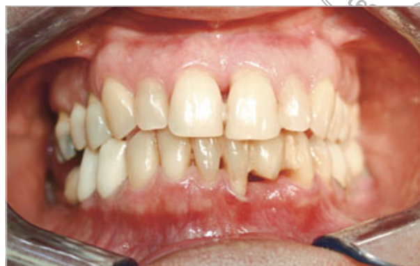
Fig 5b Maximum intercuspation. Note the posterior shift from the previous centric position.