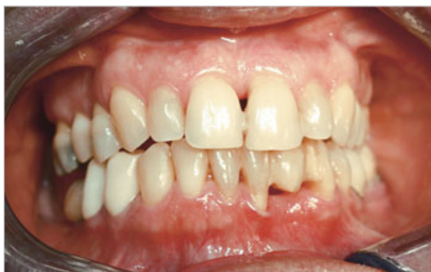
Fig 5a Among the various dynamic malocclusion features, a slide from RCP to MI \geq 2 mm has been shown by the literature to be a potential, even if weak, risk factor for TMD. 21 Its prevalence in our TMD patients was up to 42.9%, but it was not comparable with general population data due to the absence of investigations on the topic. The figure shows centric relation contacts on the palatal surface of the maxillary incisor that force backward the inferior teeth.