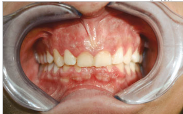
Fig 2 Excessive overbite ( \geq 4 mm) had a prevalence in the current TMD patient population (21.1%) that is within the range of the prevalence at the general population level (12.3% to 23.8%).