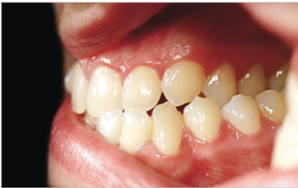
Fig 1 Posterior crossbite. The prevalence in our TMD patient population (25.0%) was similar to the prevalence described in studies on adult general population, ranging from 7.9% to 30.6%.