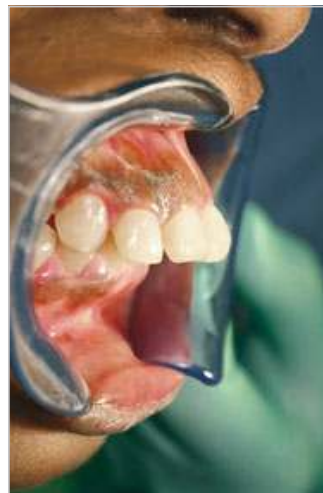
Fig 4 Excessive overjet ( \geq 5 mm), as shown in this lateral view, had a prevalence in the current TMD patient population (11.6%) that is within the range of the prevalence at the general population level (6.2% to 36.8%).

guidelines, standardized techniques for muscle and joint palpation are performed to assign axis I physical diagnoses of muscle disorders (ie, myofascial pain with or without limited opening), disk displacement (ie, disk displacement with or without reduction, with or without limited opening), and/or other joint disorders (ie, arthralgia, osteoarthritis, osteoarthritis). In this regard, it should be borne in mind that the updated version of such diagnostic criteria, now called DC/TMD, 26 was not available at the time of this investigation.