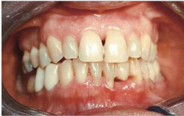
Fig 5a Among the various dynamic malocclusion features, a slide from RCP to MI \geq 2 mm has been shown by the literature to be a potential, even if weak, risk factor for TMD. 21 Its prevalence in our TMD patients was up to 42.9%, but it was not comparable with general population data due to the absence of investigations on the topic. The figure shows centric relation contacts on the palatal surface of the maxillary incisor that force backward the inferior teeth.