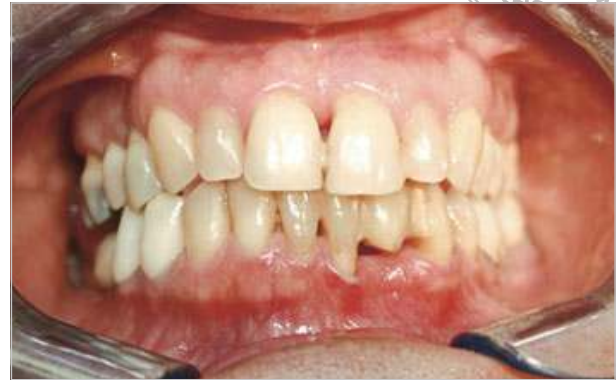
Fig 5b Maximum intercuspation. Note the posterior shift from the previous centric position.