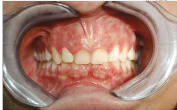
Fig 2 Excessive overbite ( \geq 4 mm) had a prevalence in the current TMD patient population (21.1%) that is within the range of the prevalence at the general population level (12.3% to 23.8%).