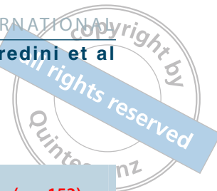
Table 1 Prevalence of the various malocclusion findings in the overall study group (n = 625), male (n = 153) and female subjects (n = 472)