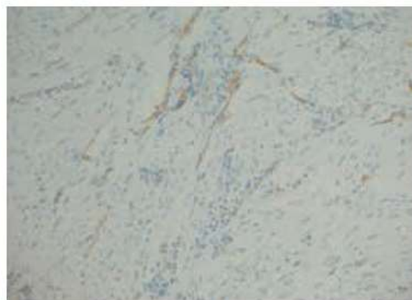
Figure 4.— Immunohistochemical CD34 stain.

It is composed of irregular nests and cords of eosinophilic cells with clear cytoplasm, high mitotic index, focal necrosis, picnosis and with invasive aspect involving the adjacent dermis irregularly with surrounding chronic inflammation and desmoplasia. Some of the tumor cells usually have PAS positive and diastase labile clear cytoplasm. Peripheral nuclear palisading is frequent at the periphery of the neoplastic lobules. Areas of trichilemmal keratinisation are disposed irregularly throughout the neoplasm which resembles squamous carcinoma.